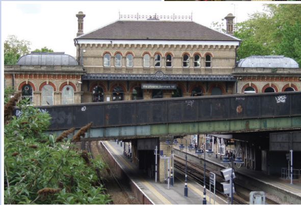
Left: Denmark Hill Station, London, was restored as a pub after a fire in 1980.