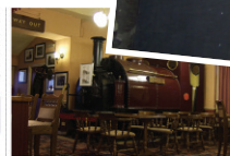
Spencer, an 0-4-0 tank built in 1863, was at one time an exhibit in Spooner's, which occupies the old goods shed at Porthmadog Harbour.

The identically named rural life in the 1880s as the bar's menu does. These string courses get a ring-side view of the main main including, since 2011, those of the re-born Welsh Highland Railway. As having an establishment named in honour of the Spooner family (James Spooner was the Festiniog surveyor and builder, while his son and other family members helped run and manage it for half a century), the interior is filled with railway artefacts. In fact, the 'beef' was a museum on one wall and the walls are covered with vintage signs and equipment, mostly belonging to this line. Pride of place once