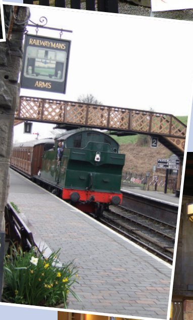
Left: Railwayman's Arms, Bridgnorth Station, Shropshire.