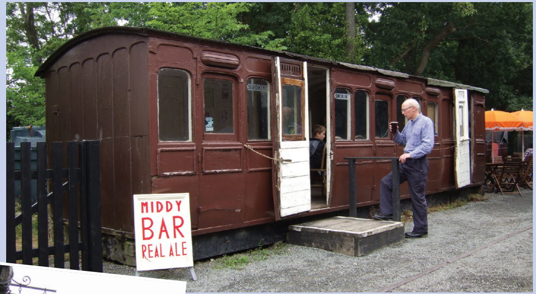
Above: The Middy Bar, Brockford, Suffolk, is an ancient third class coach carefully converted for real ale lovers